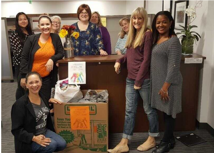
Above show photo of San Diego Regional Center Founder's Day Action Activity benefitting San Diego Rescue Mission