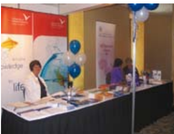
University of Western Sydney and Xi Omicron banners and representative.

The Xi-Omicron Chapter of STTI, a Region 2 chapter, co-hosted the conference with the University of Western Sydney. A total of 22 countries were represented carrying out the theme: "Many Roads to Travel: Social, Political, and Economic Implications of Women's Health."