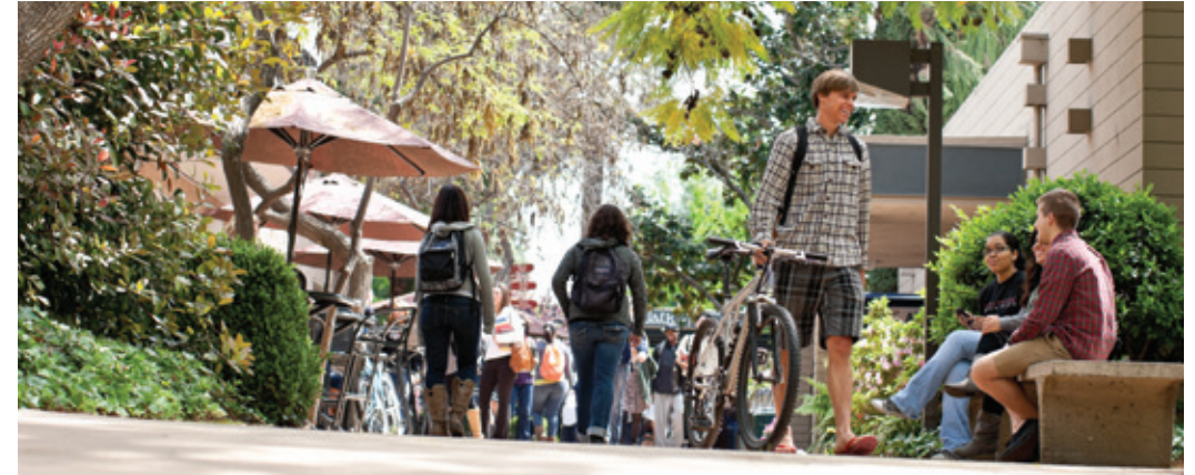
East Campus / Fall Semester / 12:35 p.m. Latitude 34.1301996 / Longitude -117.8890061

Azusa Pacific is an evangelical, Christian university committed to putting God First . While students do not have to be Christian to attend APU, our faith is part of everything we do on campus. Faculty pray with students and encourage dialogue about the Christian faith in the classroom. As part of the undergraduate experience, students attend chapel three times a week. Seven weekly chapel options, including International Chapel, offer diverse worship experiences to choose from, and renowned speakers, pastors, and authors provide biblical, relevant, challenging messages.