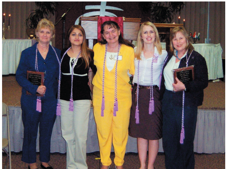
Award Winners at the Spring Induction Ceremony