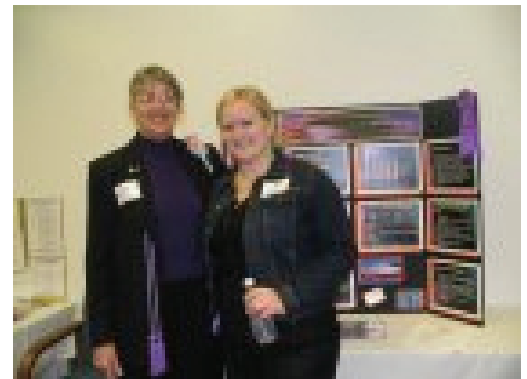
Students share their reasearch posters

If you are interested in applying for an award to assist you with your research, please email me at mklakovich@apu.edu and I will be happy to assist you to prepare and submit your application. The process is quick and easy and it's never too early to apply for the 2006 award!