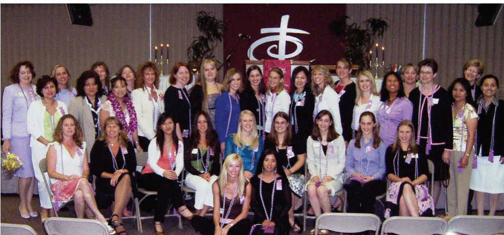
New Inductees into Iota Sigma Chapter 2005

Forty Undergraduate and Graduate students at Azusa Pacific University, as well as five community nurse leaders, were inducted into the Iota Sigma Chapter of The Honor Society of Nursing, Sigma Theta Tau International (STTI) at Azusa Pacific University on April 23, 2005.