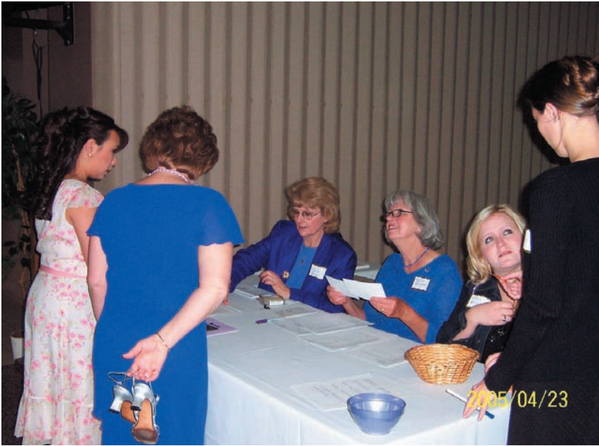
Members are Welcomed to the Induction Ceremony