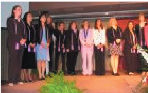
New Member are introduced at the SON Spring Pinning Ceremony

Sigma Theta Tau works to foster, develop and connect nurse scholars and leaders worldwide to improve health care. The society promotes nursing excellence through its initiatives in research, leadership, an electronic library, programming and publications and develops and distributes nursing knowledge for use in practice. The more than 700 members of Iota Sigma Chapter welcome these newest members.