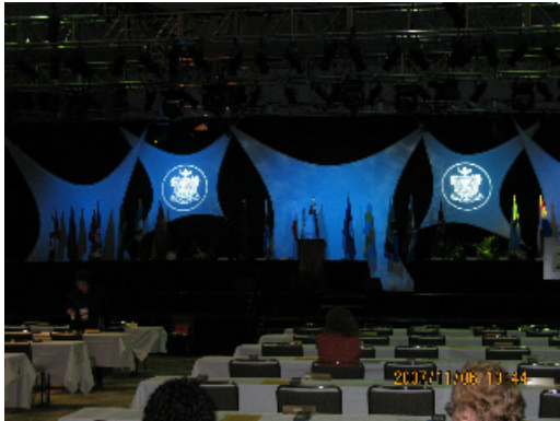
The delegate session hall