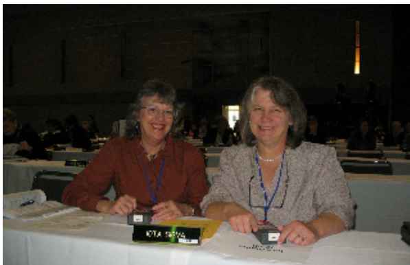
Iota Sigma Delegates at the Conventio