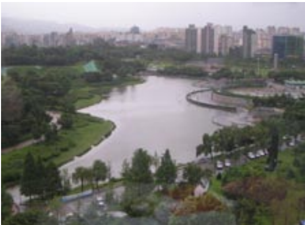
Room with a view: Olympic Park and Seoul

IMAGINE THIS... You have just arrived in an unfamiliar country after a disorienting 12-hour flight. You do not understand the loud announcements in several languages. All the colorful signs are in Asian characters. After claiming baggage, you search for ground transportation, where ten buses are lined up to admit passengers. You have no way of knowing which one to take to the city! You hesitate, turning back into the terminal. Is this a dream? As you wonder about it, two young women in pink jackets approach. Sensing your confusion, they smile in unison saying: “Welcome to Korea! Are you here for the NCF Conference?” Hearing your relieved “Yes” they ask about your flight, help you buy a ticket and guide you toward the right bus for Seoul Olympic Parktel.