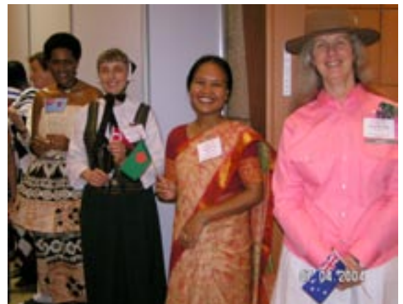
Ready for the parade of nations: Opening ceremony

My hotel room reservation is for bed #6 in a room with only 5 beds, already taken by colleagues from Singapore. Discovering this, we laugh and leave it to the front desk to sort out while we go to supper together.