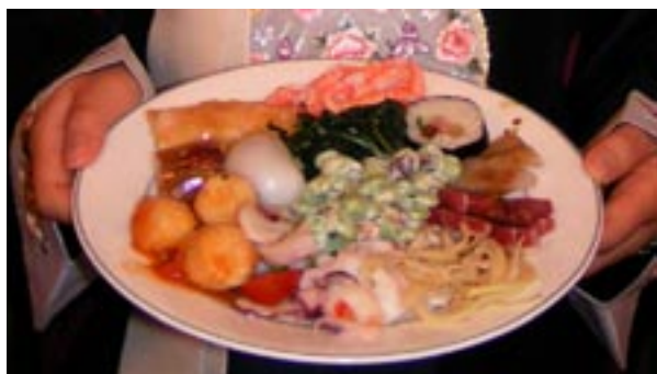
Beautiful, mouth-watering food at Korean culture night celebration!

Our meals were prepared in the hotel kitchens and featured a stunning variety of fresh and cooked foods from Korea and around the world. Besides omelets and cereals, breakfast possibilities included many protein and fish dishes, as well as vegetables and salads. I found could indulge my love of fish and vegetables completely, while occasionally spicing it up with Korean kimchee.