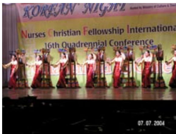
A colorful "Drum Dance" highlights Korean culture