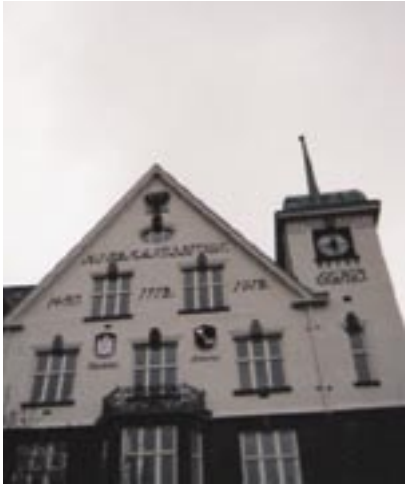
History the Norwegian Way.....