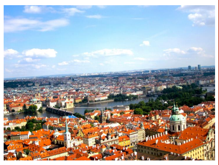
View of Prague from top of tower in St. Vitus Cathedral

Attending this conference enhanced our educational experiences because we took part in research that will benefit Azusa Pacific University's School of Nursing as well as study abroad, mission trips, and service learning programs all over the world. We are blessed to have met people who are dedicated and passionate about research. They have opened our eyes to a different aspect of nursing. We are encouraged to pursue research in the future as we begin our careers as newly graduated nurses.