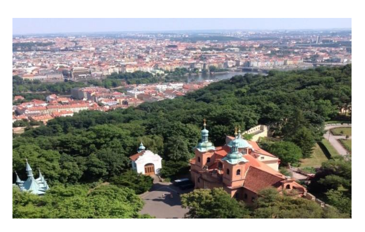
Prague from the Petrin Tower