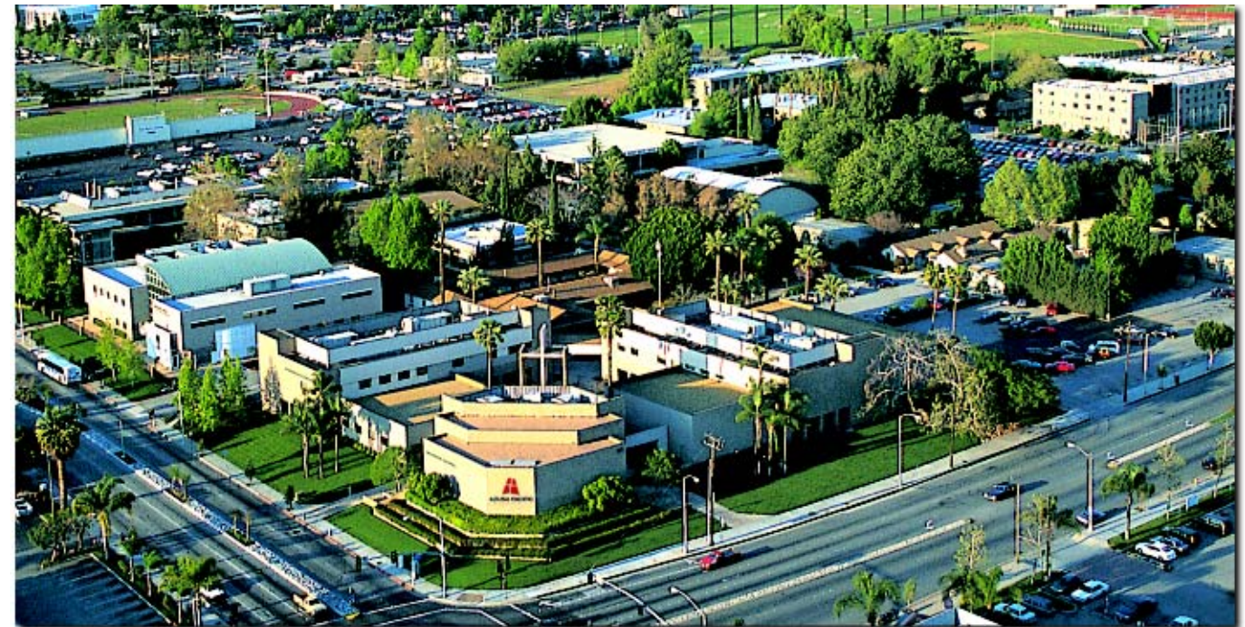
Azusa Pacific University - East Campus

Development Standards (Section 5) and Design Guidelines (Section 6) implement the planning and design concepts provided in this document by giving detailed specifications for future development on site. The Standards and Guidelines are intended to supplement the City of Azusa’s Municipal Code. Where provisions of the APU Specific Plan Design Standards and Guidelines differ from the City of Azusa Municipal Code, the Standards and Guidelines contained herein are to govern development within the campus area. The Guidelines and Standards encourage appropriate design solutions while maintaining sufficient flexibility to accommodate construction practicalities and economic feasibility.