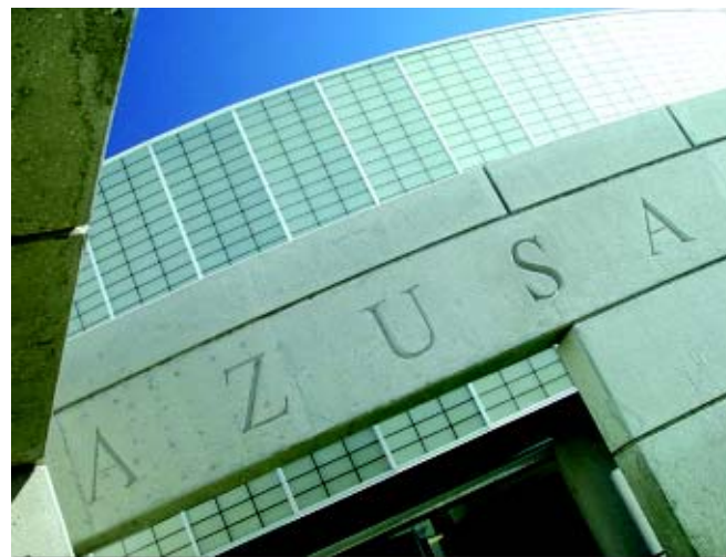
Azusa Pacific University

This Specific Plan is a comprehensive guide to defining the character of future physical development for the main campus of Azusa Pacific University (APU). The campus is located on two nearby sites (East Campus and West Campus) in Azusa, California. This plan does not address other properties owned or leased by APU in Southern California.